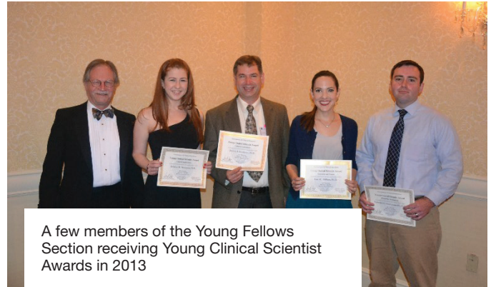
A few members of the Young Fellows Section receiving Young Clinical Scientist Awards in 2013