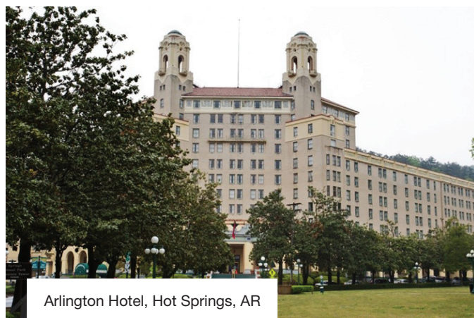
Arlington Hotel, Hot Springs, AR

We are excited about the outstanding program and venue for the 2016 meeting and look forward to seeing you there!