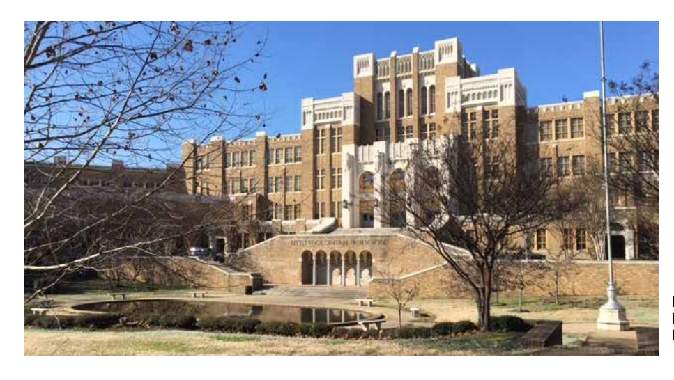
Little Rock Central High School National Historic Site