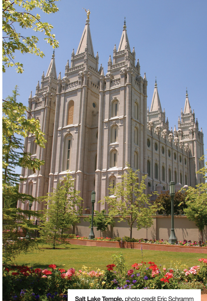
Salt Lake Temple