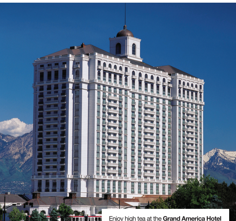
Enjoy high tea at the Grand America Hotel

As a group, the officers of the Auxiliary greet and welcome Auxiliary attendees upon arrival at the hotel with an agenda of planned activities. A first evening gathering is held to introduce new members and connect with friends and acquaintances. Over the next few days, various social gatherings are planned along with organized tours and information highlighting points of interest in the host city. A general meeting of the Auxiliary is also held with all members welcome.