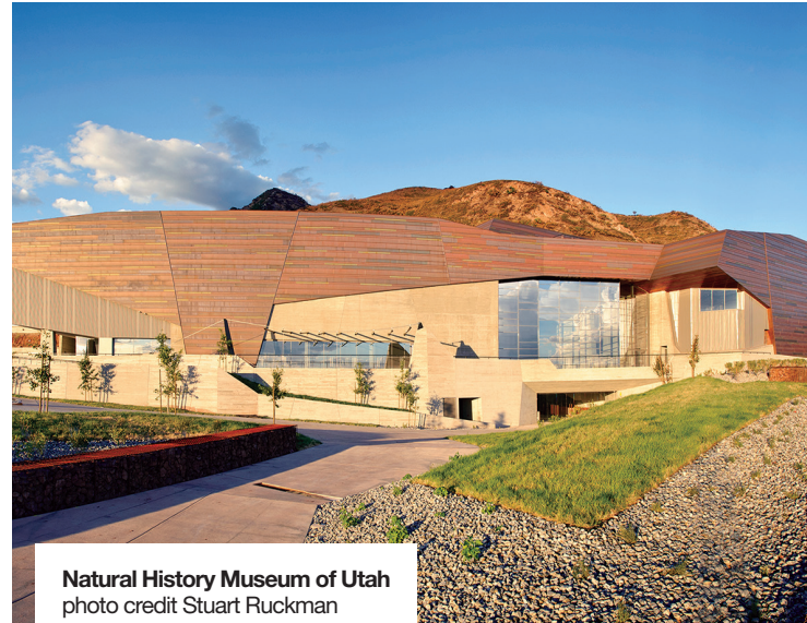
Natural History Museum of Utah

We are excited about the outstanding program and venue for the 2015 meeting and look forward to seeing you there!