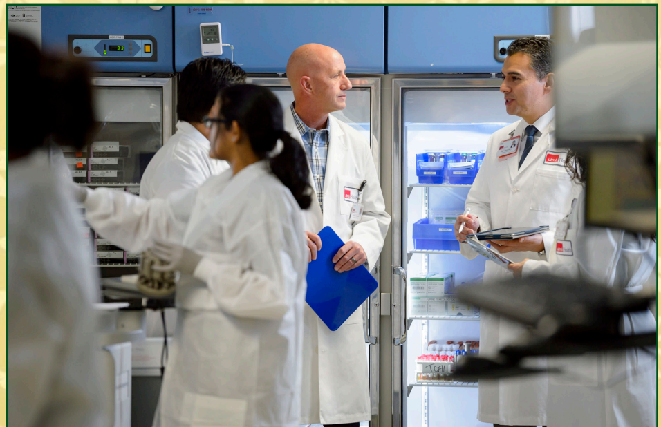
Above: Diagnostic Management Team laboratorians at the University of Texas Medical Branch at Galveston, Texas.

In September, 2015 the National Academy of Medicine issued a report on diagnostic error in the United States. The principal conclusion is that every adult American has experienced at least one diagnostic error. One of the major factors contributing to diagnostic error is the failure to order the correct diagnostic tests, with underutilization of tests more common than overutilization. The diagnostic management team is a clinical service focused on recommending the appropriate laboratory tests for individual patients in clinical context, and providing a correct interpretation of laboratory test results. It has been implemented for more than