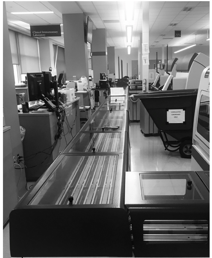
Clinical Immunoassay Laboratory Mayo Clinic 2021