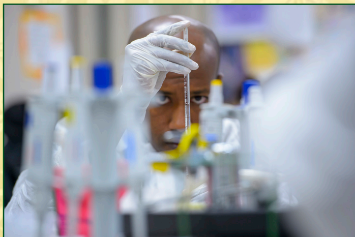
Above: a medical laboratory technician at the University of Texas Medical Branch at Galveston, Texas lab.