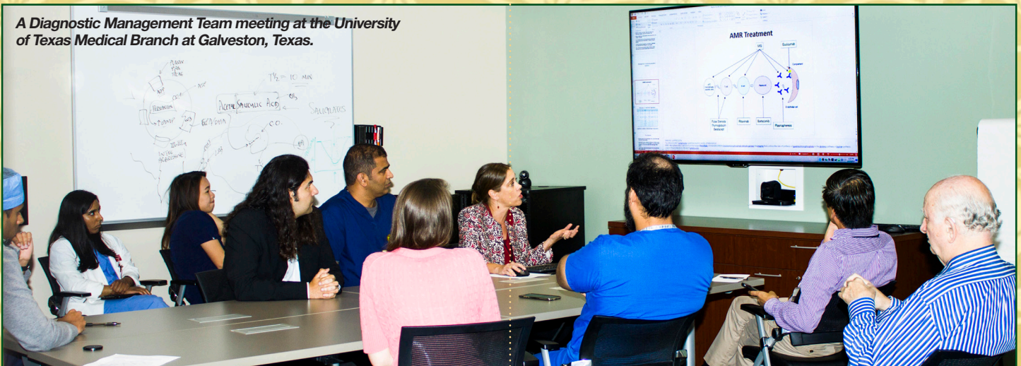
A Diagnostic Management Team meeting at the University of Texas Medical Branch at Galveston, Texas.