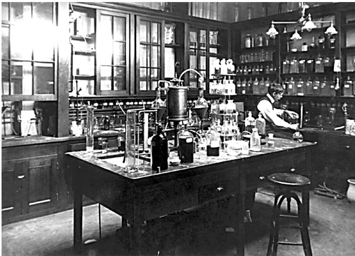
Folin Pathology Laboratory McLean Hospital: 1905

Below is a pathology laboratory 120 years ago versus (to the right) a modern lab.