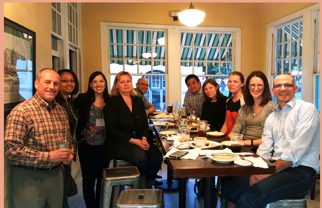
The Young Fellows Section is a great opportunity to network and meet other young scientists.